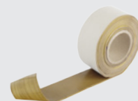
TECSOUND® S50 BAND